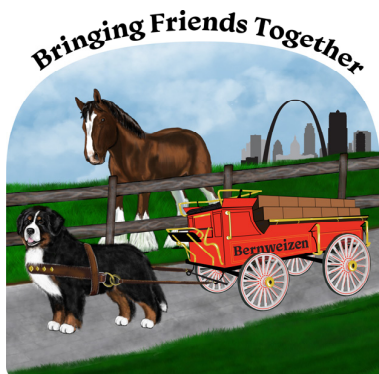
BMDCA National Specialty 2024

Registration & Catalog Sales at Ringside Health Clinics at Service Center International Guest Breakfast at Founders Room Futurity Obedience Versatility Showcase Veterans Sweepstakes Health Auction at Holiday Inn